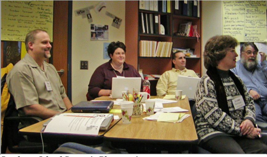
Southeast Island Strategic Plan meeting