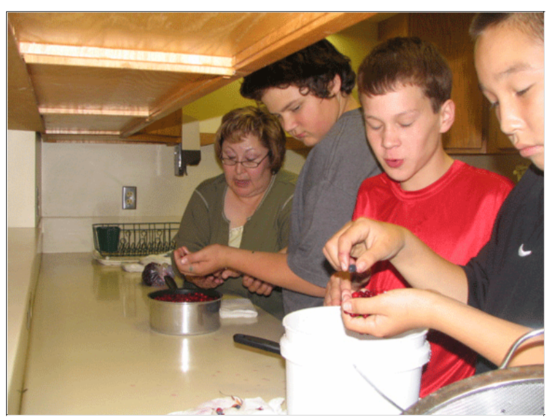
ICE Berry picking activity in Dillingham

QS2 partner districts enjoy a close alliance with AASB's federal grant Alaska's Initiative for Community Engagement. This initiative provides the support and resources to give Alaskans, at the local level, the information, tools, and assistance to work collectively in preparing Alaska's youth for the future. An Alaska ICE staff liaison is assigned to each QS2 partner district to directly support families, communities, and various other school constituencies to promote measurable increases in healthy behaviors and a reduction in the number of Alaskan youth who engage in unhealthy behaviors. It is AASB's strong belief that reduction in risky behaviors will lead to higher numbers of students demonstrating proficiency on required state academic assessments. The over arching approach is one of building on a community and school's strengths and growing additional supports for youth.