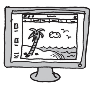
a) A place you can visit on the computer