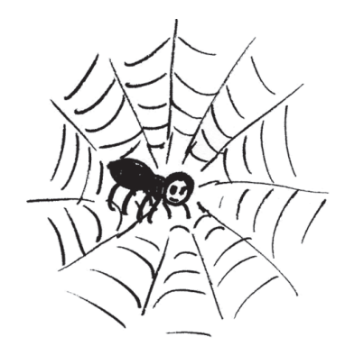
b) A place where a spider builds a web