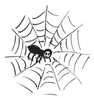
b) A place where a spider builds a web