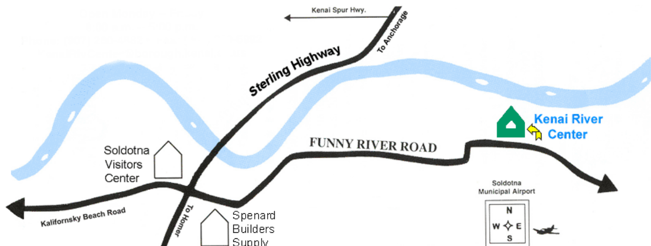
Map to Kenai River Center